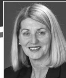
Sharon Grierson MP Federal Member for Newcastle